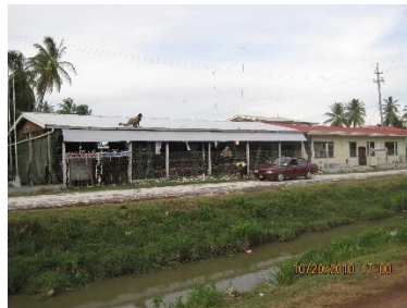
Completed tent with tarps