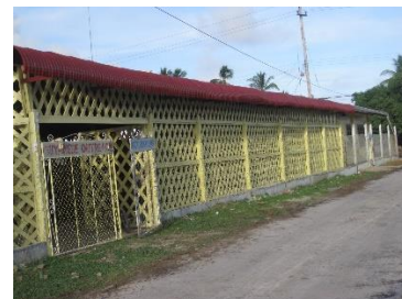
Completed lattice wall

However, the vision was always to build a second floor for teams to stay in when they are in Guyana. These teams will help with GO's educational programs and various activities for the community. The opportunity has now presented itself for me to leave for Guyana in mid- July to start the first phase of the renovation of the building. After the completion of the first phase, and as funds become available, we will then complete the second phase.